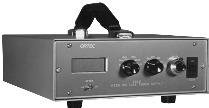
556H "Bench-Top" High-Voltage Power Supply.